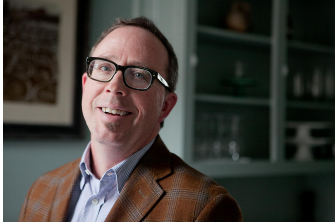
Full size photo available at http://johntedge.com/press-photo.jpg

In May of 2017, Penguin will publish his latest book, The Potlikker Papers: A Food History of the Modern South .