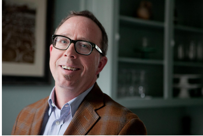
Full size photo available at http://johntedge.com/press-photo.jpg

In May of 2017, Penguin will publish his latest book, The Potlikker Papers: A Food History of the Modern South .